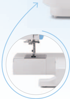
Free Arm Easily sew sleeves and cuffs