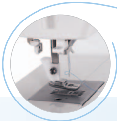
Automatic Needle Threader Sewing's biggest timesaver