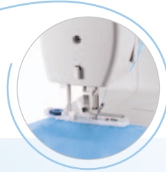
1 Fully Automatic 1-Step Buttonhole Professional results at the touch of a button