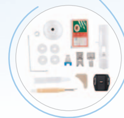
FREE Accessories Included Important extras to get you started