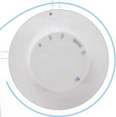
Adjustable Stitch Length Keep seams strong and prevent bunching on any type of fabric