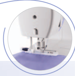
1 Fully Automatic 1-Step Buttonhole Professional results at the touch of a button