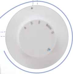
Adjustable Stitch Length & Width Keep seams strong and prevent bunching on any type of fabric