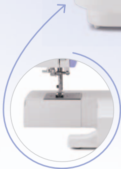
Free Arm Easily sew sleeves and cuffs