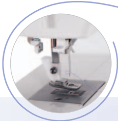
Automatic Needle Threader Sewing's biggest timesaver