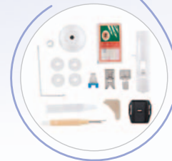
FREE Accessories Included Important extras to get you started